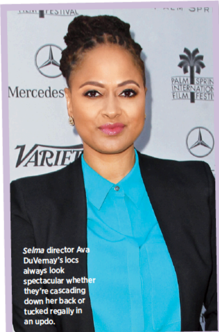
Selma director Ava DuVernay's locs always look spectacular whether they're cascading down her back or tucked regally in an updo.

Want more definition for your ringlets? Try CURLS' Blueberry Bliss Curl Control Jelly. Not only does this multi-purpose styler reduce frizz, but the infused blueberry extract minimalizes hair loss and graying as well. $18, target.com