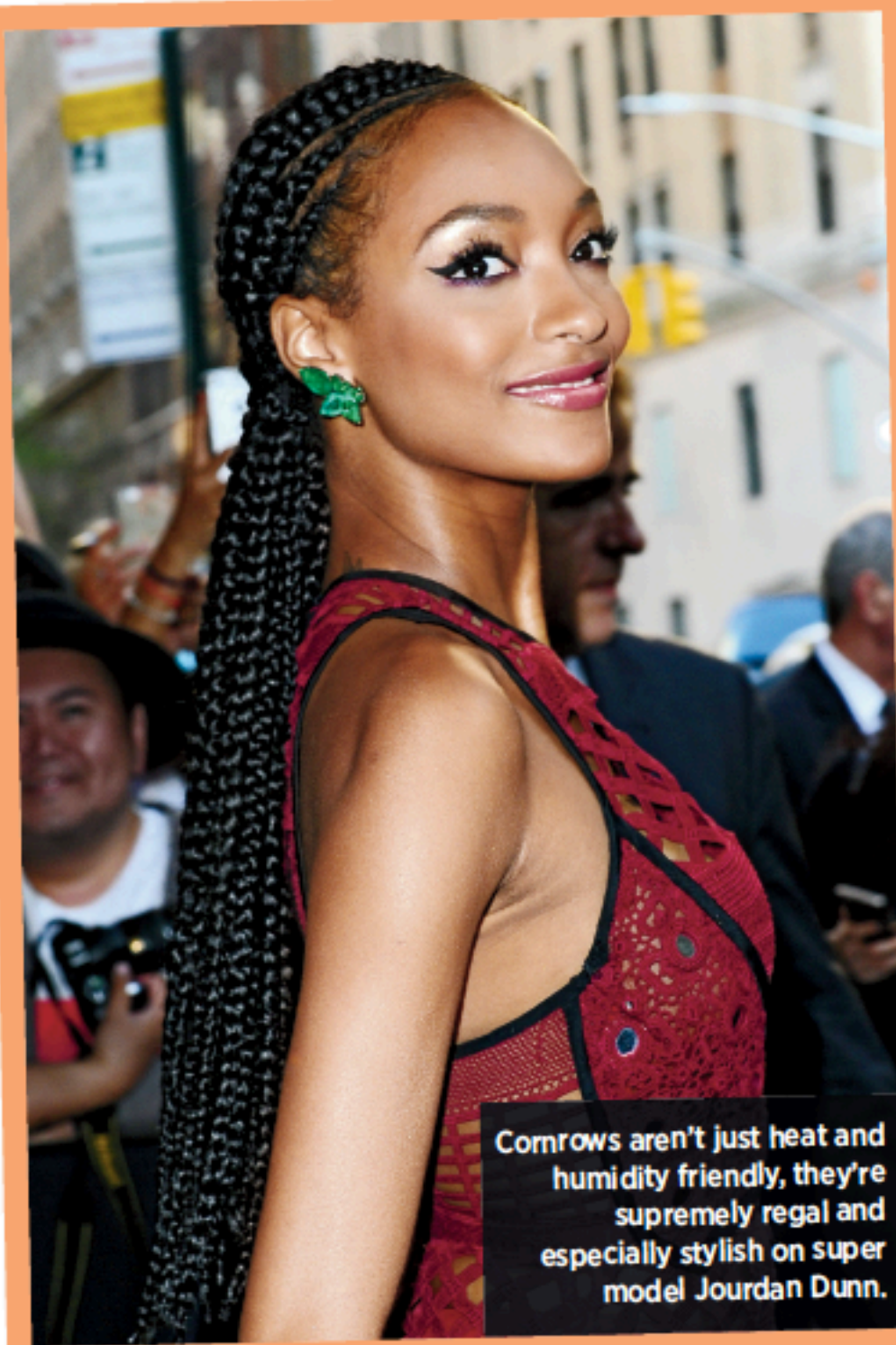
Comrows aren't just heat and humidity friendly, they're supremely regal and especially stylish on super model Jourdan Dunn.

Braids, waves and ponies are the go-to styles for beach, barbeque and rooftop fun.