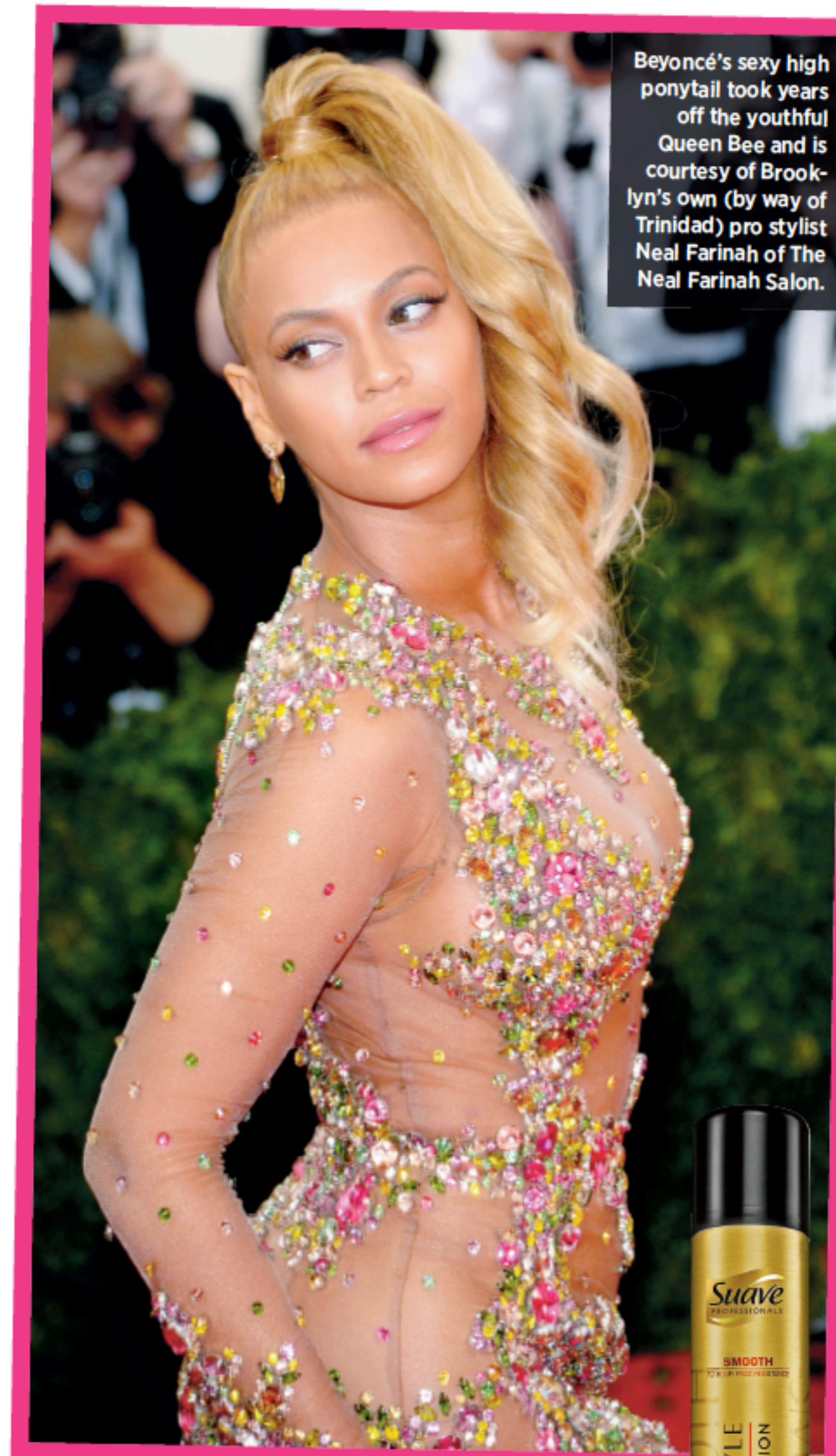
Beyoncé's sexy high ponytail took years off the youthful Queen Bee and is courtesy of Brooklyn's own (by way of Trinidad) pro stylist Neal Farinah of The Neal Farinah Salon.

#NeverShampooYourCurls—Again with DevaCurl Kit For All Curl Kind. The four-piece set includes a No-Poo, that cleanses hair of dirt and buildup minus the lather and sulfates; One Condition, a daily conditioner that reduces frizz; Light Defining Gel, a curl shaper and Styling Cream which elongates tendrils while nourishing them. $30, devacurl.com